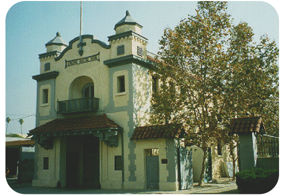
Engine House No. 18

Please join us in praying for God's provision as we seek to transform our neighborhood. To God be the glory...great things he has done!