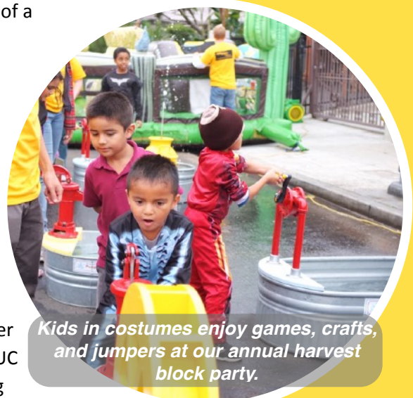
Kids in costumes enjoy games, crafts, and jumpers at our annual harvest block party.

You can also give online at www.redeemercp.org Don't forget to include your address so we can send you your gift!