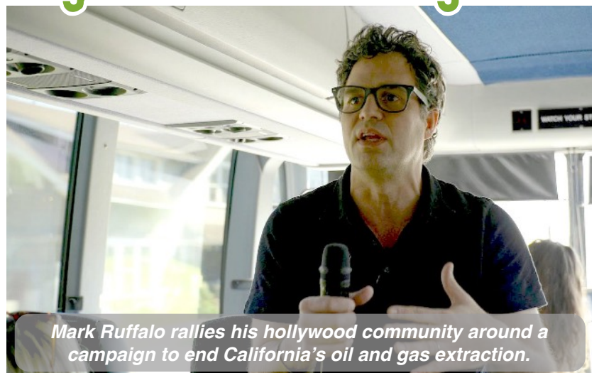
Mark Ruffalo rallies his hollywood community around a campaign to end California's oil and gas extraction.

A few days before the Oscars, Redeemer Community Partnership gave a neighborhood tour to Mark Ruffalo, Leonardo DiCaprio, Rashida Jones, Norman Lear, and many other Hollywood creatives on the the health and safety dangers of the Jefferson Drill Site. These celebrities are bringing attention to the dangers of current oil extraction methods, and our city's failure to protect low income communities. We hope their influence will help get the message out that oil and gas extraction facilities are incompatible with neighborhoods! It never hurts to have the Hulk on your team.